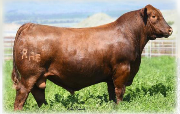
Bieber Spartan E639 Sire of lots 13,14