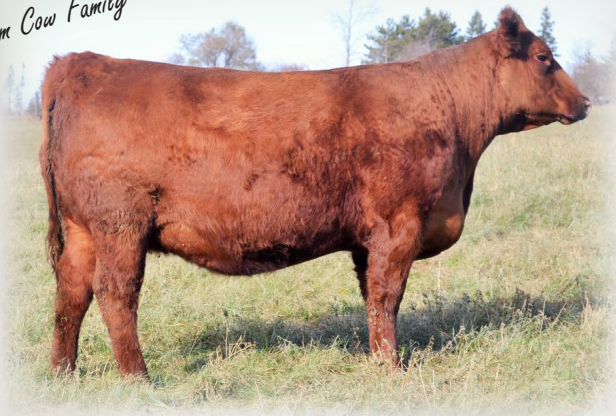
Hilcom Cow Family