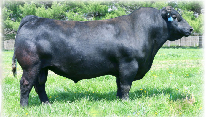
LD Capitalist 316 Sire of lots 9,10