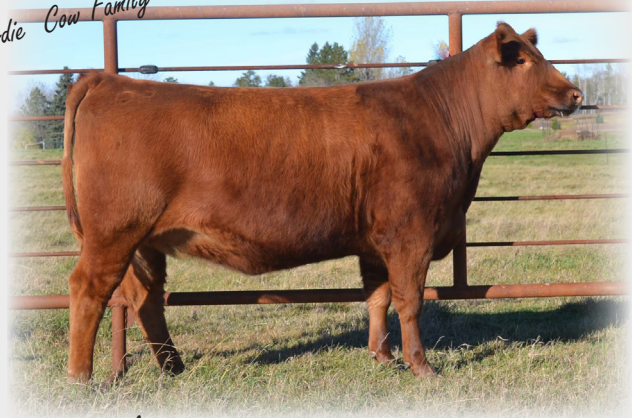
Birdie Cow Family