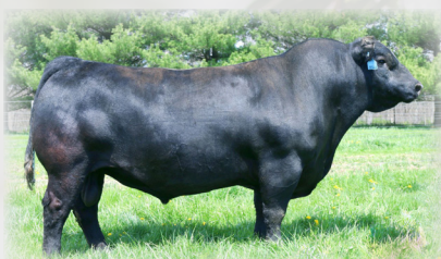
LD Capitalist 316, Grandsire of Lot 2

BIEBER CL ATOMIC C218 DAM: DAHLKE MS HILTON 10F ET DAHLKE MS HILTON 263C