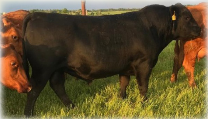
5L Capitalist 525-225F Sire of lots 2,4