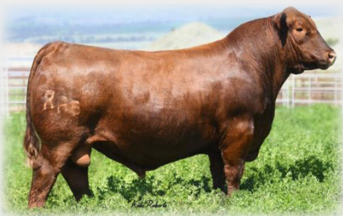
<— Sire of Lot 13,14