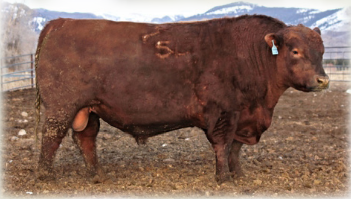
5L Bourne 117-48A Sire of Lots 1,3,28