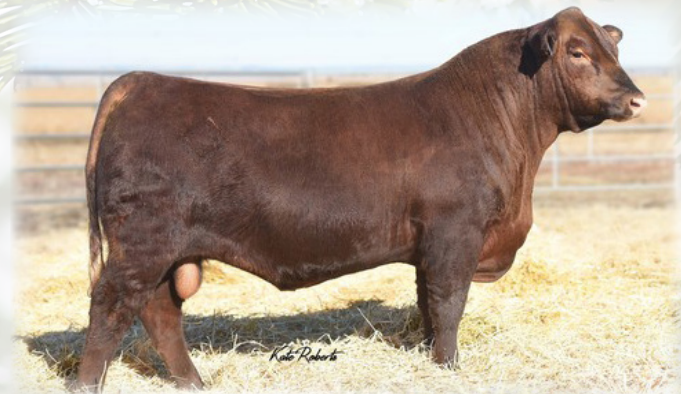
Collier Finished Product Sire of lots 5-7