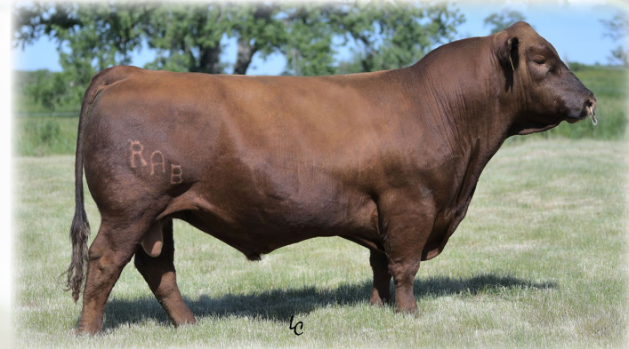
Bieber CL Stockmarket E119 Sire of lots 11,12