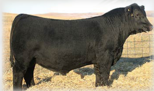
S A V Elation - Sold for $800,000