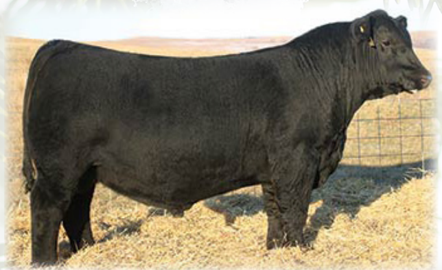
S A V Elation 7899 Sire of lot 8