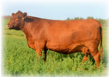
Granddam of Lot 1

BIEBER CL ATOMIC C218 DAM: DAHLKE MS HILTON 13F ET DAHLKE MS HILTON 263C