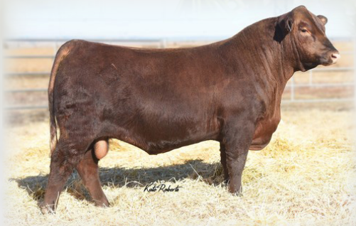
Collier Finished Product - Sire of Lots 5,6,7