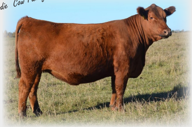
Birdie Cow Family