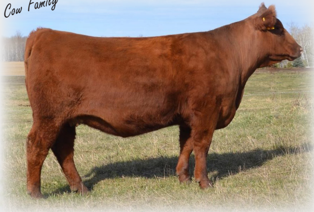
Hilcom Cow Family