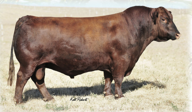
Andras Fusion R236 Sire of lots 16-18